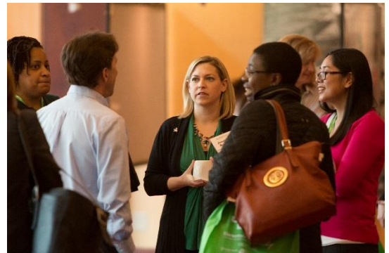
Networking at the 2015 Dialogue for Action

“All the speakers were wonderful. The breakout sessions and awards lunch provided an excellent opportunity to meet people. The poster session was a great value-add.”