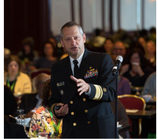
Rear Admiral Boris Lushniak, MD, MPH, Deputy Surgeon General of the United States delivers a dynamic presentation on skin cancer prevention.

The conference features a mix of state-of-the-art presentations and interactive, dynamic “conversations” among participants. The Dialogue equips participants with concrete tools and effective strategies for use in both clinical and public health settings. All participants are encouraged to take the dialogue back to their communities and workplaces to promote appropriate screening.