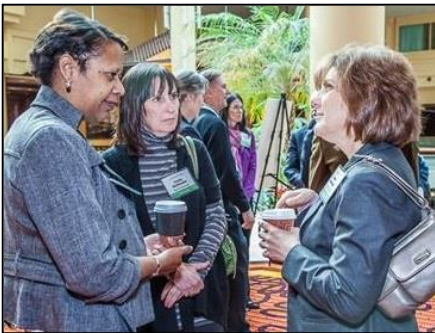
Attendees discuss cancer screening issues during a break.